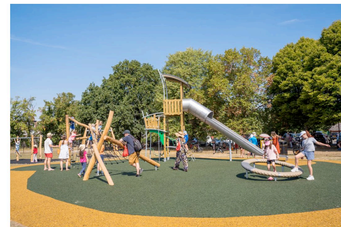
Childrens' Play Area