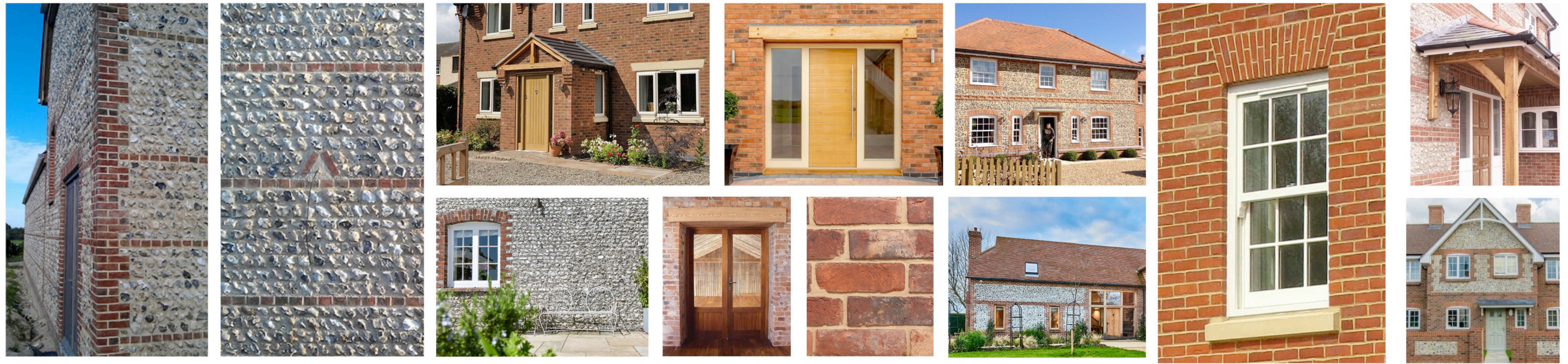
Indicative Materials Key