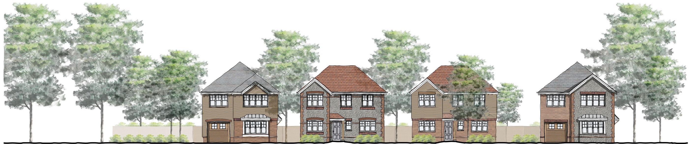
Indicative Streetscene 1:200 @ A3 & 1:100 @A1

Indicative images of house types from a similar masterplan project by David James Architects comprising of a number of high-quality houses.